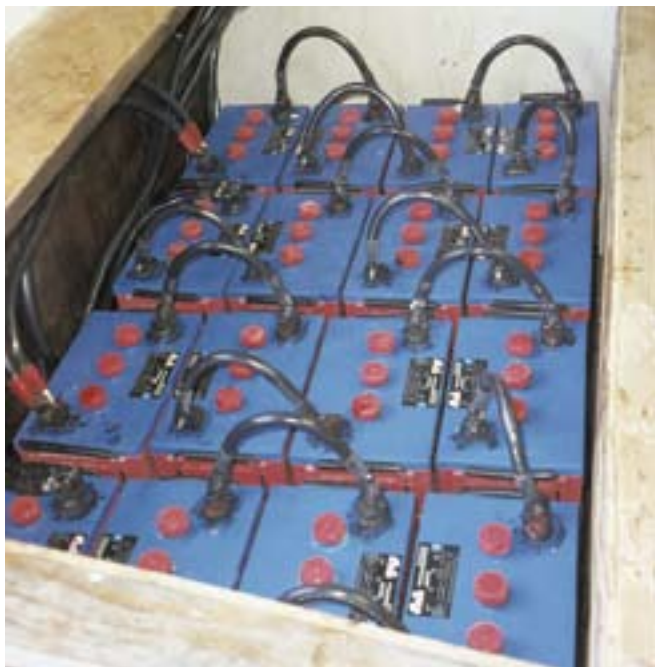
Sixteen Surrette S-530s store wind energy for later.