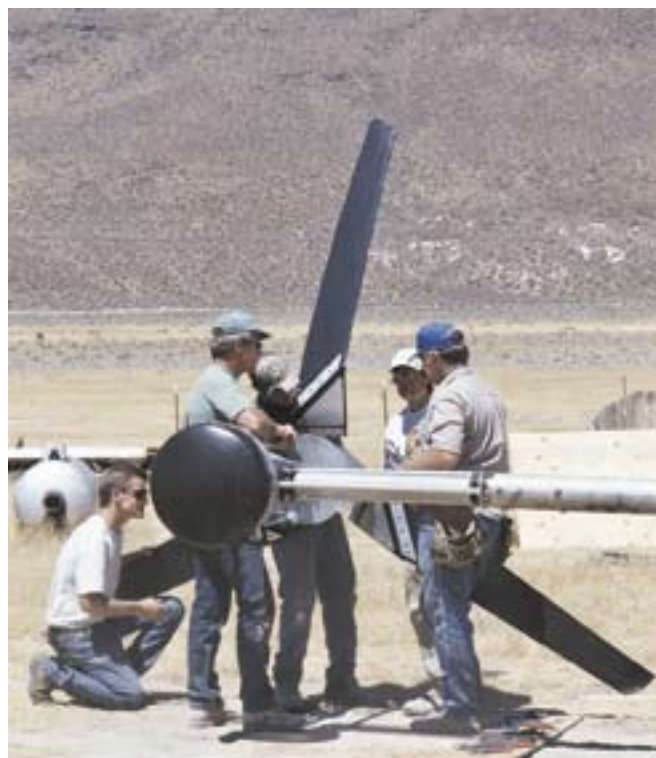
Almost ready for raising—the Proven WT2500 weighs more than 450 pounds.

Originally, Paul had planned to pay for up to fifty percent of the wind turbine installation through the CEC rebate program. Unfortunately, the original program ended in December 2002, just as Paul was getting ready to apply for the funds.