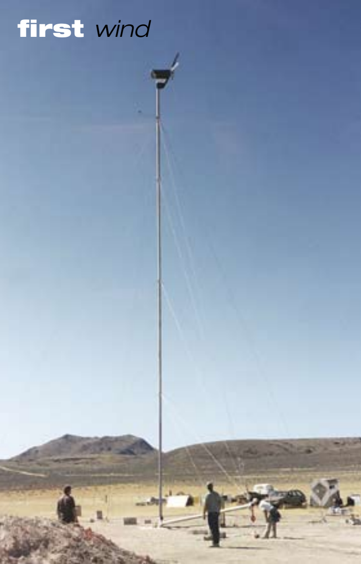
Success—the Proven WT2500 up and running on the 84 foot tilt-up tower.

low rpm. The lower the rpm, the longer the turbine will last and the quieter it will be.