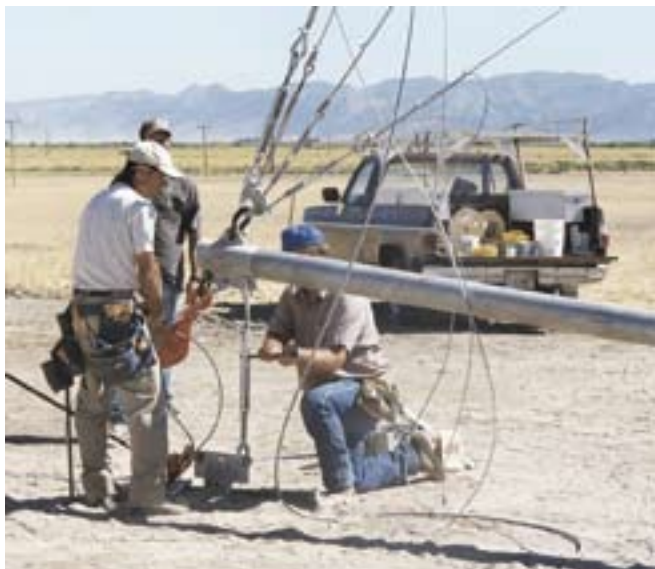
Gin pole down, tower up—with careful measuring, the gin pole turnbuckle will come out plumb, making tensioning easier.

assembled. The electric cable, a #2 (33 mm 2 ) tray cable (a jacketed conductor) was used. The 3 / 16 inch (5 mm) aircraft cable for the manual brake was taped to the end of the tray cable and together both cables were drawn up the inside the pipe tower. The tray cable was then suspended at the very top with a Kellums grip, hung on a 3 / 8 inch (10 mm) stainless steel bolt. As the tension on the Kellums grip increases from the weight of the cable, it tightens its hold.