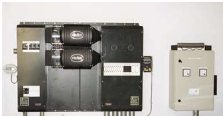
The Outback power center with two FX2548 inverters, and the Proven ECM2502 controller (at right).

The power system also boasts a Hub 4, which is used to connect the inverters to the OutBack Mate. The Mate has a digital display, and coordinates the operation of the inverters. In the future, when the PV array is installed, the Mate will also communicate with the OutBack MX60 charge controller.